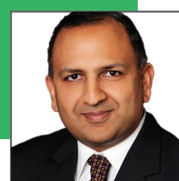
Prof. Pratap Bhanu Mehta Distinguished Visiting Professor PhD from Princeton University, USA