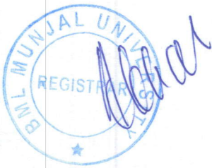
Registrar BML Munjal University

The above policy is as per the guidelines issued by UGC.